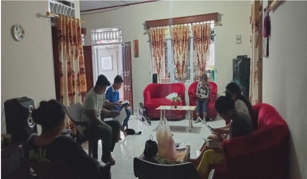
Figure 3: Implementation of Bible study group

The purpose of this diaconal ministry is to build care and concern togetherness. Based on observations, the diaconal ministry through visitation and communion has succeeded in building a sense of care and togetherness among the congregation. The congregation feels emotionally and spiritually supported, especially those who are experiencing difficulties in life. This activity is very helpful in creating a close relationship between the pastor and the congregation, where the congregation feels more valued and cared for.