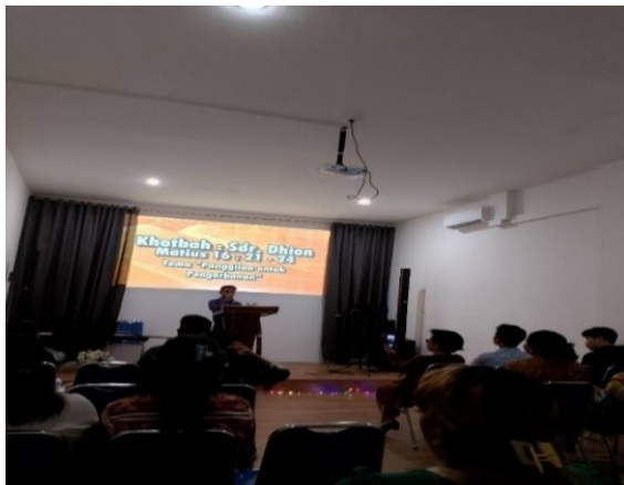
Figure 5. Shermon the Word of God

Diaconal ministry is carried out by preaching God's Word in front of congregation. The theme taught the congregation to guard against excessive attention to worldly pleasures. As a result, the congregation showed intentions to improve their life habits to focus more on God. Some congregants even did a self-evaluation and began to reduce activities that could interfere with their relationship with God.