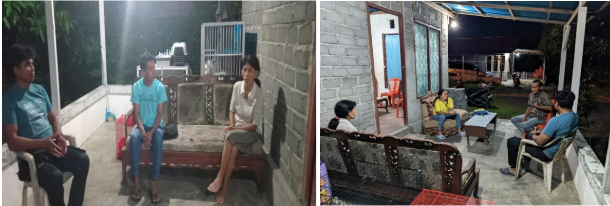
Figure 7. A visit to a congregation that is experiencing problems