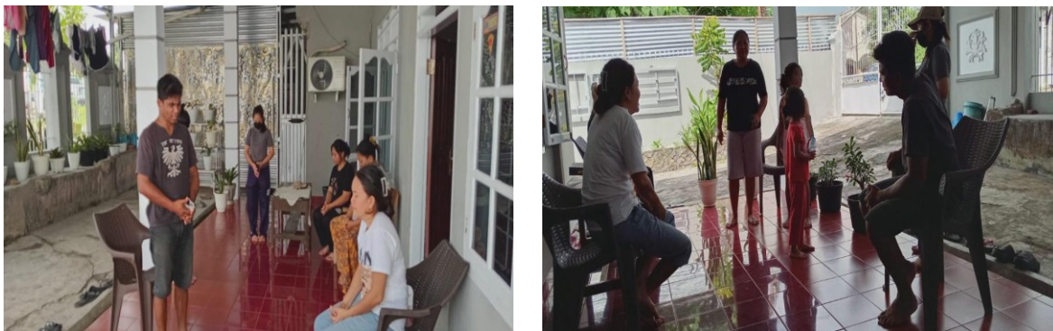
Figure 2. Visit To Bitung Madidir Urre Congregation

When arriving at the place of visit the pastor of the GPEI Bitung congregation greeted with a word of welcome so that the atmosphere became more familiar between the pastor and the congregation, then continued with sharing from the congregation about their current situation and any complaints or problems that the pastor wanted to pray for then after that continued. The prayer finished around 11:00 and continued with the distribution of gifts to the congregation and the service of love ended at 13:00 with a prayer together to separate to their respective places.