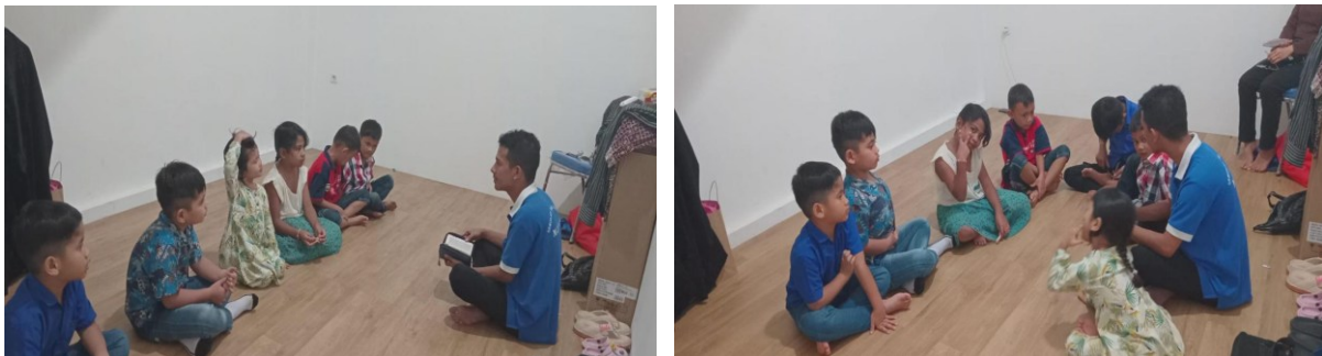
Figure 8. Preaching to Sunday school

The diaconal ministry is carried out by preaching the word of God to Sunday School children.