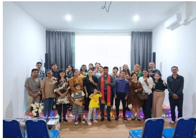
Figure 6. GPEI Bitung Pastor and Congregation